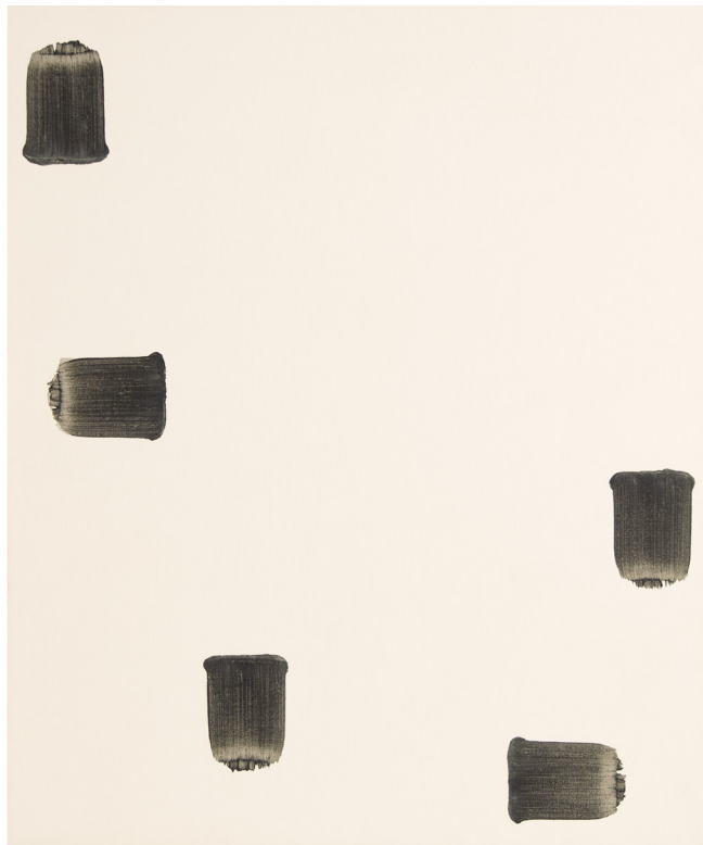
Lee Ufan, Correspondance, 1994, cm 120x100, oil and mineral pigments on canvas