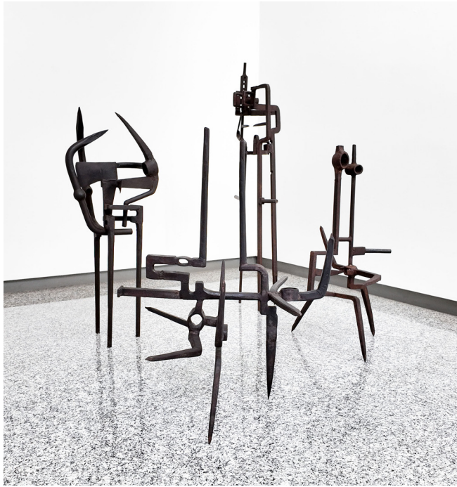
Miguel Berrocal, serie Opus Roma, 1956 | 1958, variable sizes, forged and welded iron