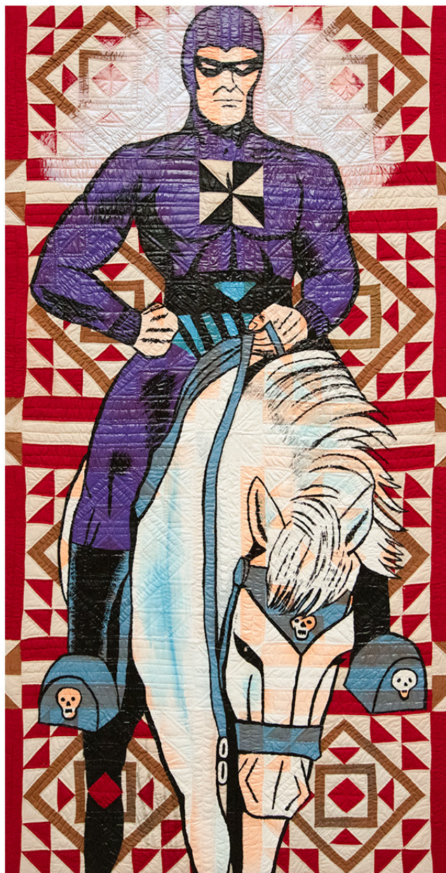
Ronnie Cutrone, The Phantom , 1996-99, 145,8x112,8, acrylic on quilt